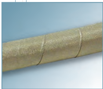
spiral-wrap cable shielding

Construction is a CuNi conductive metalized polyester fabric with conductive acrylic adhesive and release liner backer.